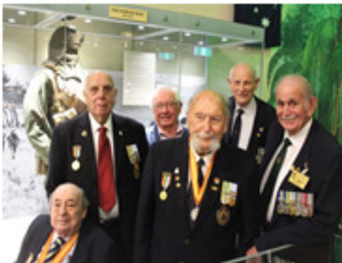
12 June 2019—Korean Veterans visit the Museum -