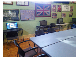
Internet access for research

provide supervised assistance for those who undertake their own research. The area is also being used as an educational area for school classes and work experience students. It is an ideal room for large meetings, e.g. Board Meeting etc. The room also has a small display that welcomes group visitors who are visiting the museum and enjoy either a morning tea or lunch provided by the Museum Catering Group (MCG).