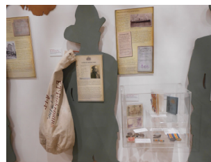
Silhouettes matching the height of the soldier story after war service.

story of early life in the Unley area. During the 1800s the town experienced frequent and severe flooding of the Brownhill Creek causing serious disruption to daily life and creating a health hazard with mud and, often, effluent flooding the streets and houses. As a result the Council took steps to improve drainage in the area and one instance of this may be seen in the large stormwater drain which runs through Keswick Barracks. We were very impressed with Unley Museum and urge members to visit. The set-up of the displays is quite different from our own Museum and I'm sure there are ideas which we can use.