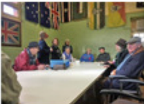
Reception area groups before a tour of the Museum

During the past year a number of changes have or are about to occur to enable the museum to reach the Museums objectives of making available resources to provide Defence, schools, visiting groups and