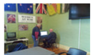
Volunteer helping a visitor to the Museum